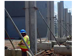
Dominion – Brambleton Substation Perimeter Wall