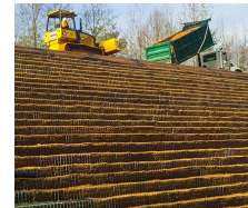
MD Rte. 2 Soil Stabilization