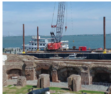
NPS - Fort Sumter NHP Pier & Electrical Upgrades