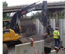
Rte. 460 Bridge Replacement VDOT H-05