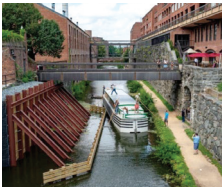
NPS - C&O Canal NHP Canal Stabilization