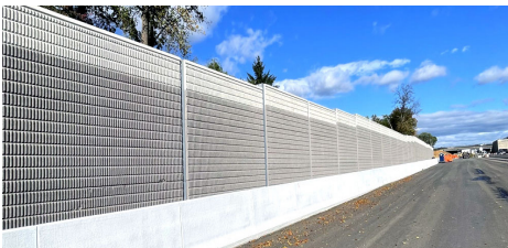
Transform I-66 Infrastructure Needs