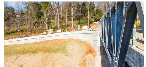
Rte. 677 Albemarle – Broomley Road Bridge Replacement