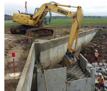
Manassas Airport Runway 34R Extensions